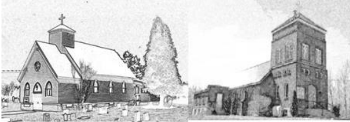
St. Georges Church Dutch Settlement